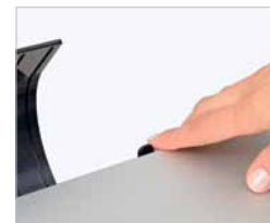
Paper pressure adjustment.