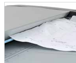
Fail-proof funnel-shaped paper feed for ease of paper insertion.